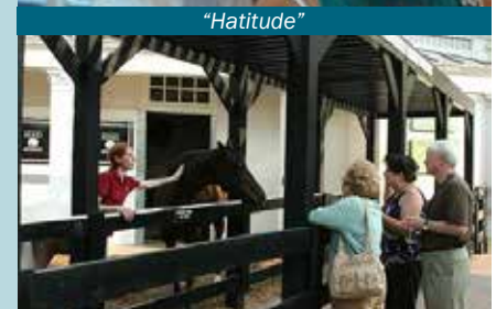
Churchill Downs Racetrack