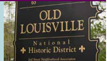
Historic Homes in Old Louisville

After guided tours of this home to multi-million dollar stallions, arrive at Churchill Downs, "Home of the Kentucky Derby" and the longest continually running sporting event in America. www.churchilldowns.com The afternoon includes a 30-minute, guided walking tour of the historic racetrack, as well as lunch at the Derby Café and a thrilling viewing of "The Greatest Race™", projected in one of the world's only 360°, 4K theaters at the adjacent Kentucky Derby Museum. You will also have the opportunity to create a custom Kentucky Derby hat with your own "Hatitude" and enjoy self-guided tours of interactive exhibits at the Museum. Visit the Gift Shop before boarding the bus back to the hotel. www.derbymuseum.org