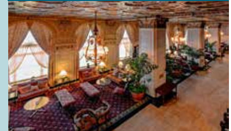
The Brown Hotel