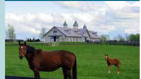
The Rolling Horse Farms